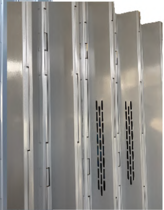
S S Imperforated (D4)