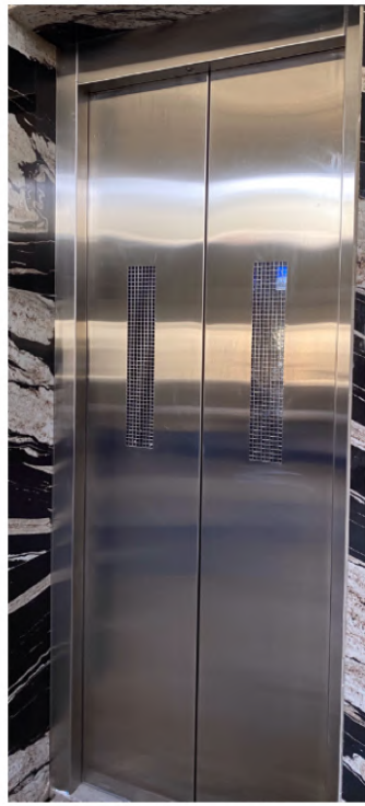
Small vision Door (S S Hairline)