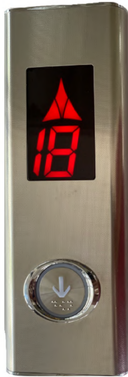
Landing panel ( LP1 Wall mounted)