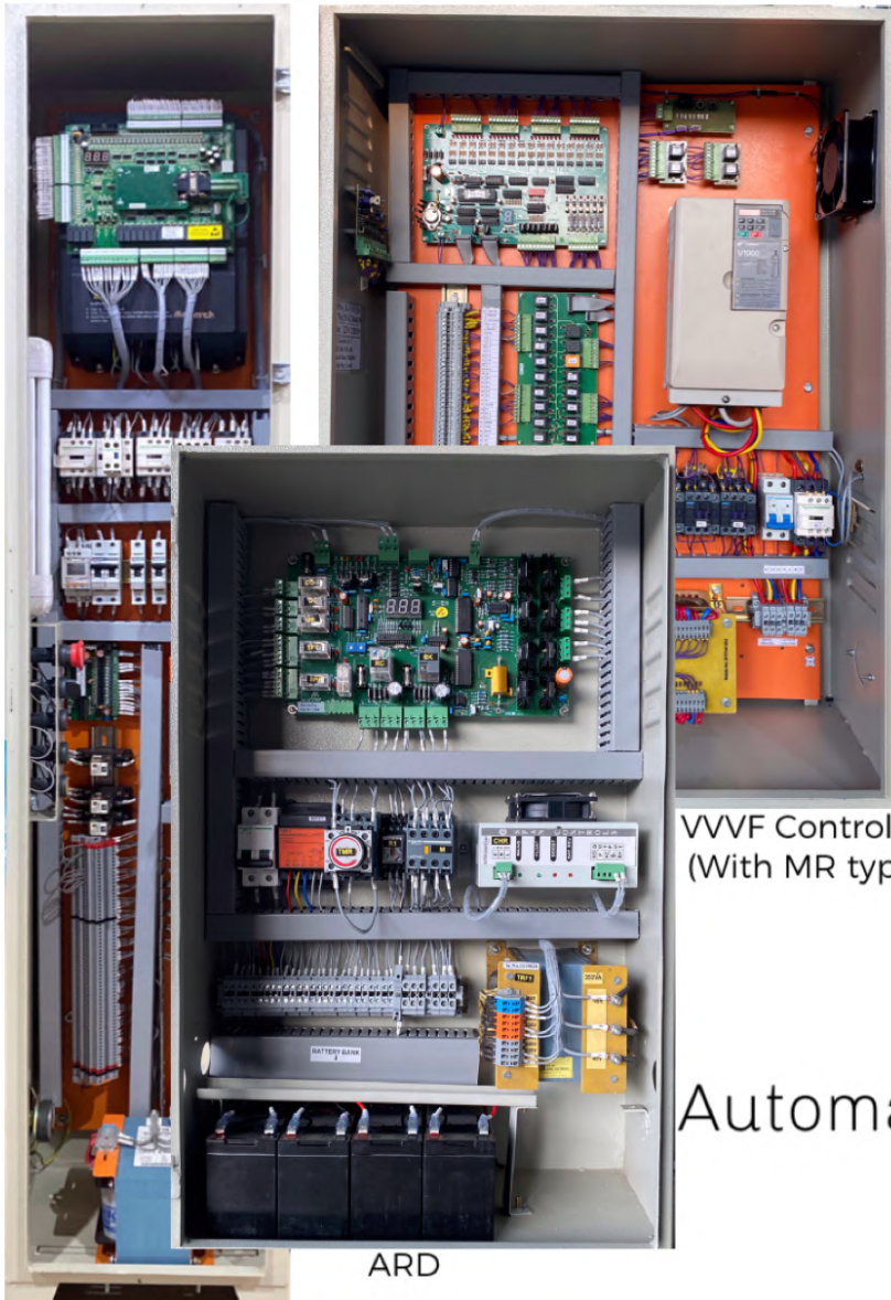
VVVF Controller (With MR type)