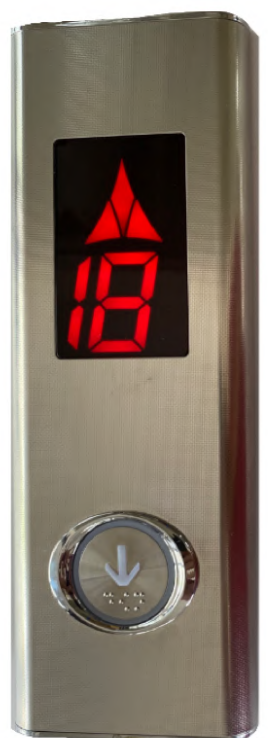
Landing panel (Wall mounted LP1)