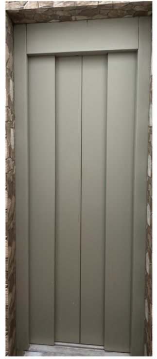
4 panel Door (M S Powder Coated)