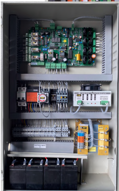
ARD (Auto Rescue Device)