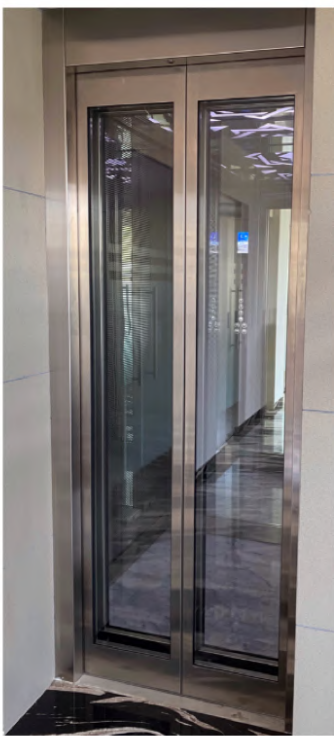
Big vision Door (S S Hairline)