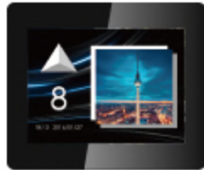
LCD display (LCD1)