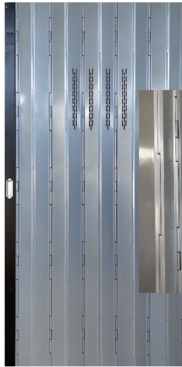
M S Imperforated (D3)