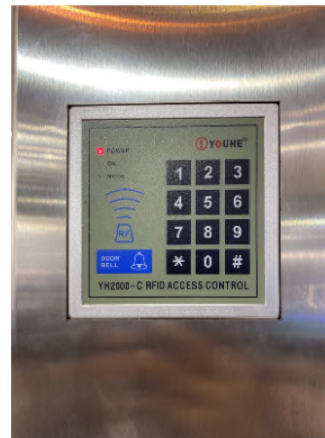
Access control (AC1)