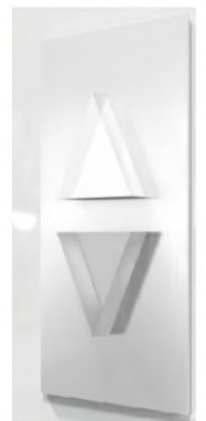
Arrival indicator (AI1)