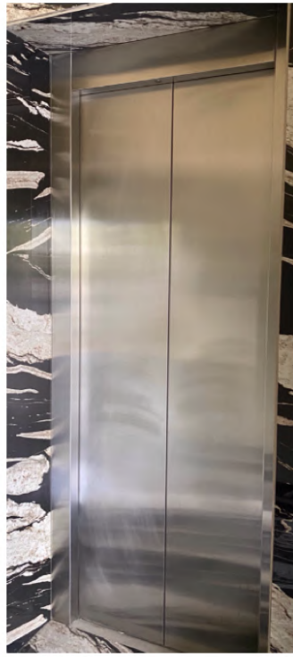
Standard Door (S S Hairline)