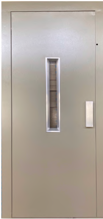
M S Swing 1 (D1)