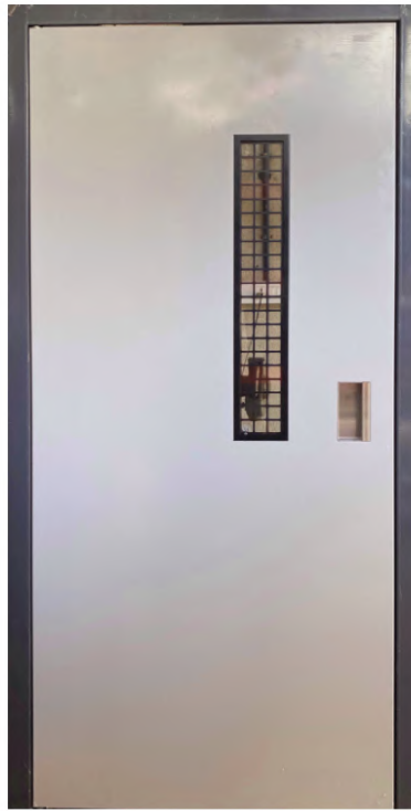
M S Swing 2 (D2)