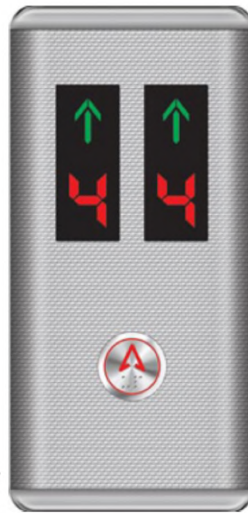
Duplex Landing panel (LP2)